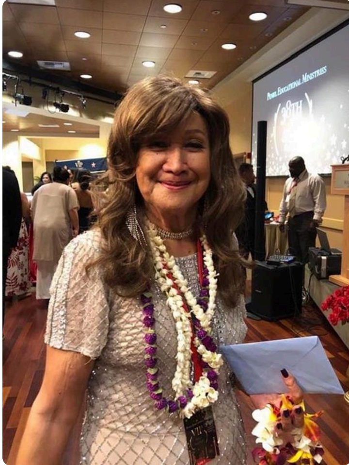
Always so Fashionable